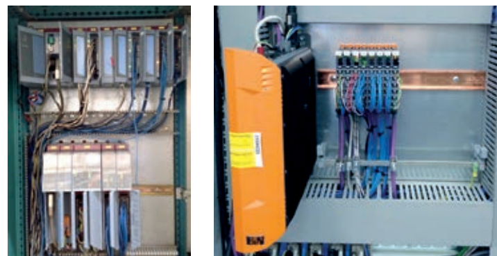
Upgrade from a preceding model to a PC5000touch

MAPLAN's control unit update offers our clients the following features and advantages: