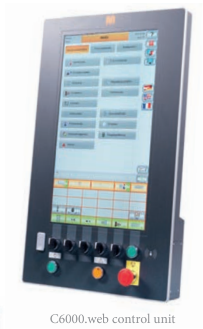
C6000.web control unit

Experience a state of the art automatized process chain which can be witnessed at several booths. www.karousel.it